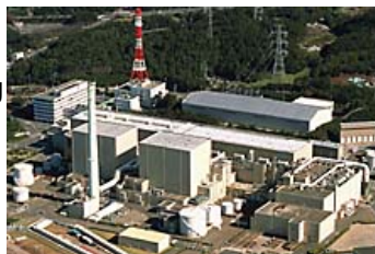
An aerial view of the Hamaoka plant in Shizuoka Prefecture, "the most dangerous nuclear power plant in Japan"

The Japanese archipelago is located on the so-called Pacific Rim of Fire, a large active volcanic and tectonic zone ringing North and South America, Asia and island arcs in Southeast Asia. The major earthquakes and active volcanoes occurring there are caused by the westward movement of the Pacific tectonic plate and other plates leading to subduction under Asia.