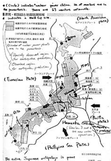
A map of Japan annotated by the author, showing the tectonic plates, areas of high ("observed region") and very high ("specially observed") quake risk, and the sites of nuclear reactors

After the greatest nuclear power plant disaster in Japan's history at Tokai, Ibaraki Prefecture, in September 1999, large, expensive Emergency Response Centers were built near nuclear power plants to